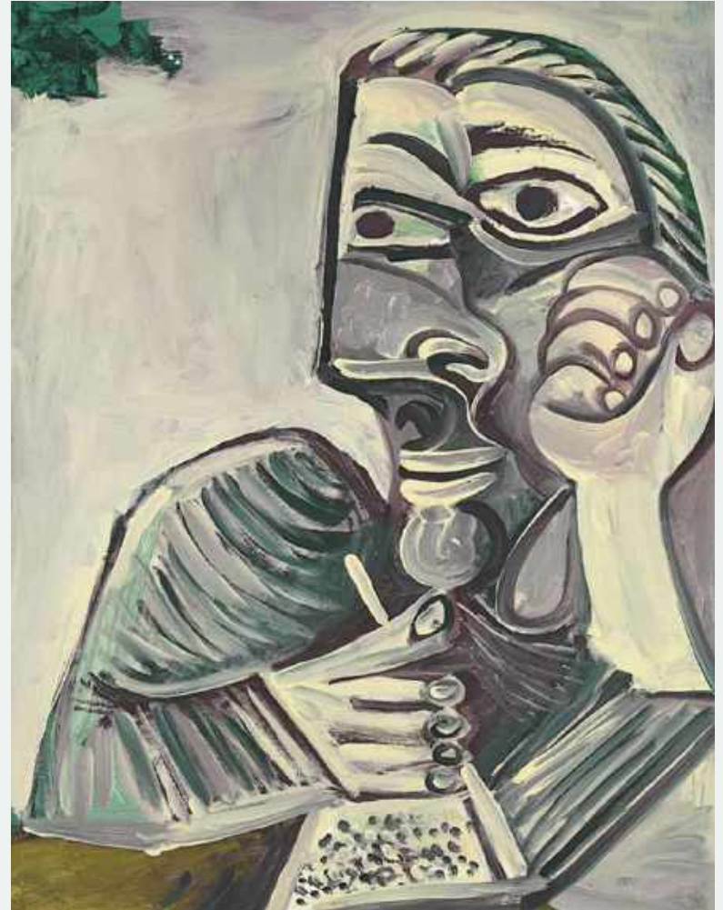
Picasso, self-portrait, 1966