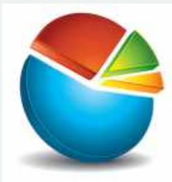
Facts & Figures